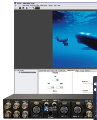
Optional breakout box available for select models.

Batch Encoding mode captures any input format to an uncompressed media file in real time and automatically transcodes it to multiple formats without user intervention, enabling easy encoding to even the most complex combinations of formats. Existing media files from differing resolutions, frame rates and sources can be transcoded to any other output format and concatenated if desired.